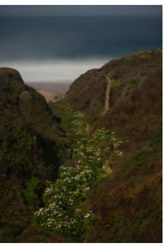
Calla Lilies, Doud Creek and Garrapata Beach