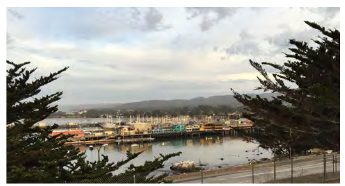
View from Lower Presidio Historic Park

Of course, PTCC members are encouraged to participate. We may even make it Group Shoot in early April.